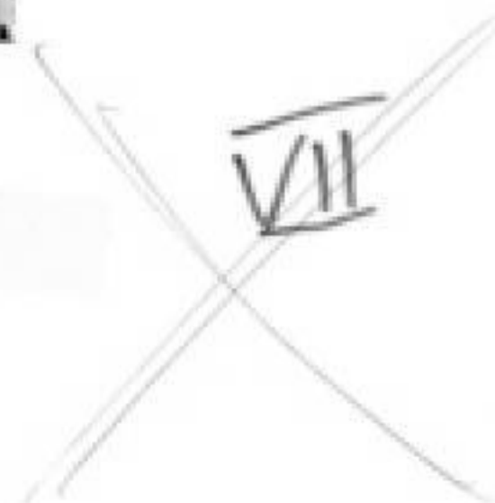
Figure 2.2 Leonore Mau and Hubert Fichte, Der Tag eines unständigen Hafenarbeiters (storyboard), 1966.