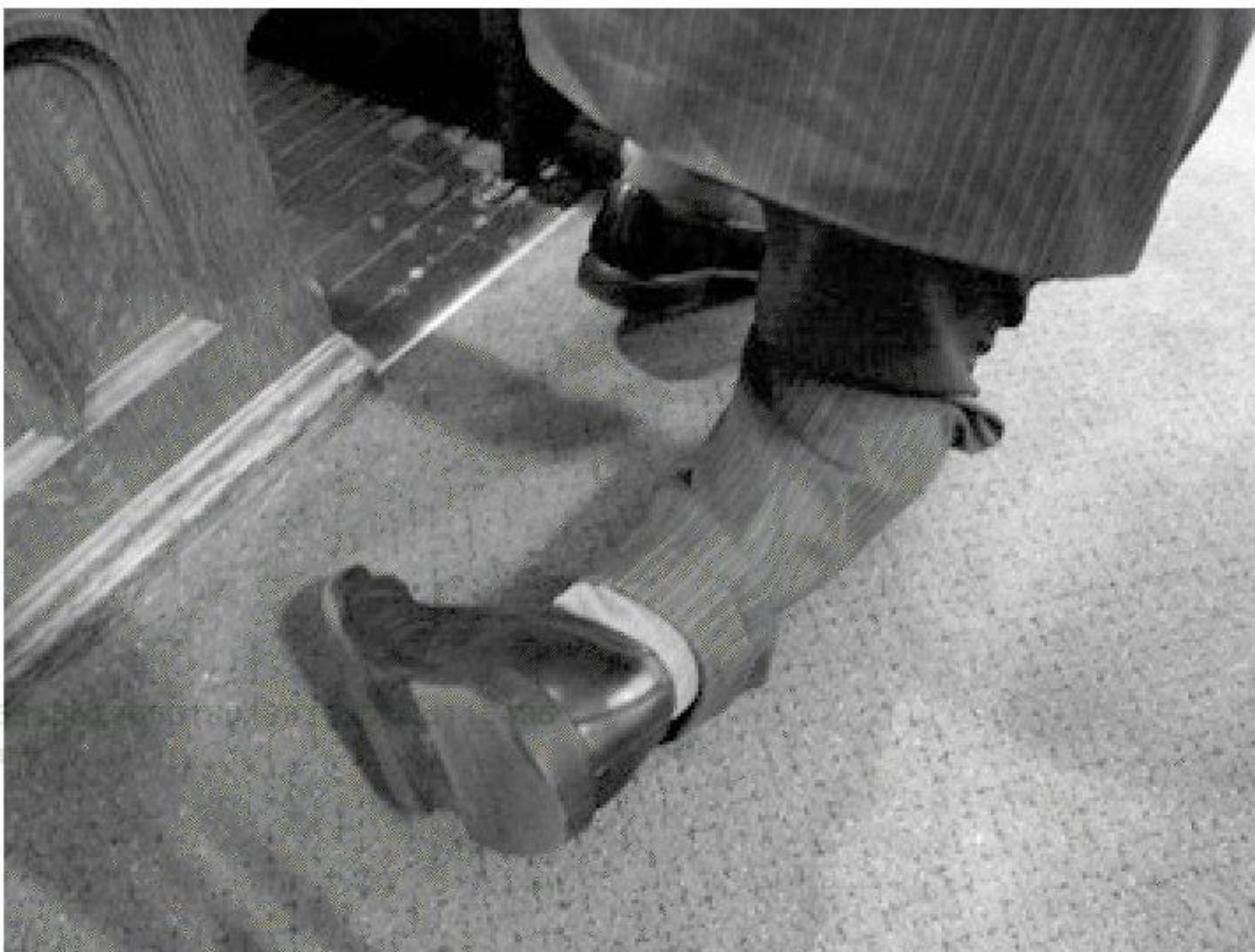
Figure 2.7 Still image from A Polish Easter in Chicago , Dick Blau, USA, 2011.

(Dick Blau, personal communication, February 26, 2012)