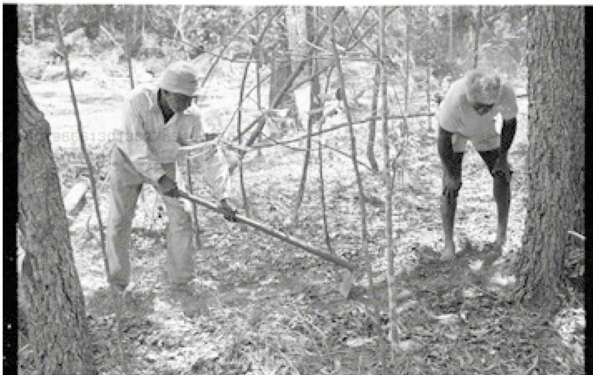
Figure 2.6 Still image from Making Gambarr , John Haviland, USA, 2009.

We could perhaps at this point ask what the possible benefits of photofilm are for anthropological research; or, put otherwise, what can such a (photo) film achieve beyond moving film images in visual anthropology film and video production, and where lies the advantage of stills used in moving sequences? More discussion, not least among practitioners, on this is needed, but one advantage is certainly that the eye can rest longer on individual scenes and explore details (similar in this to slow motion) than would have been the case with incessantly moving images.