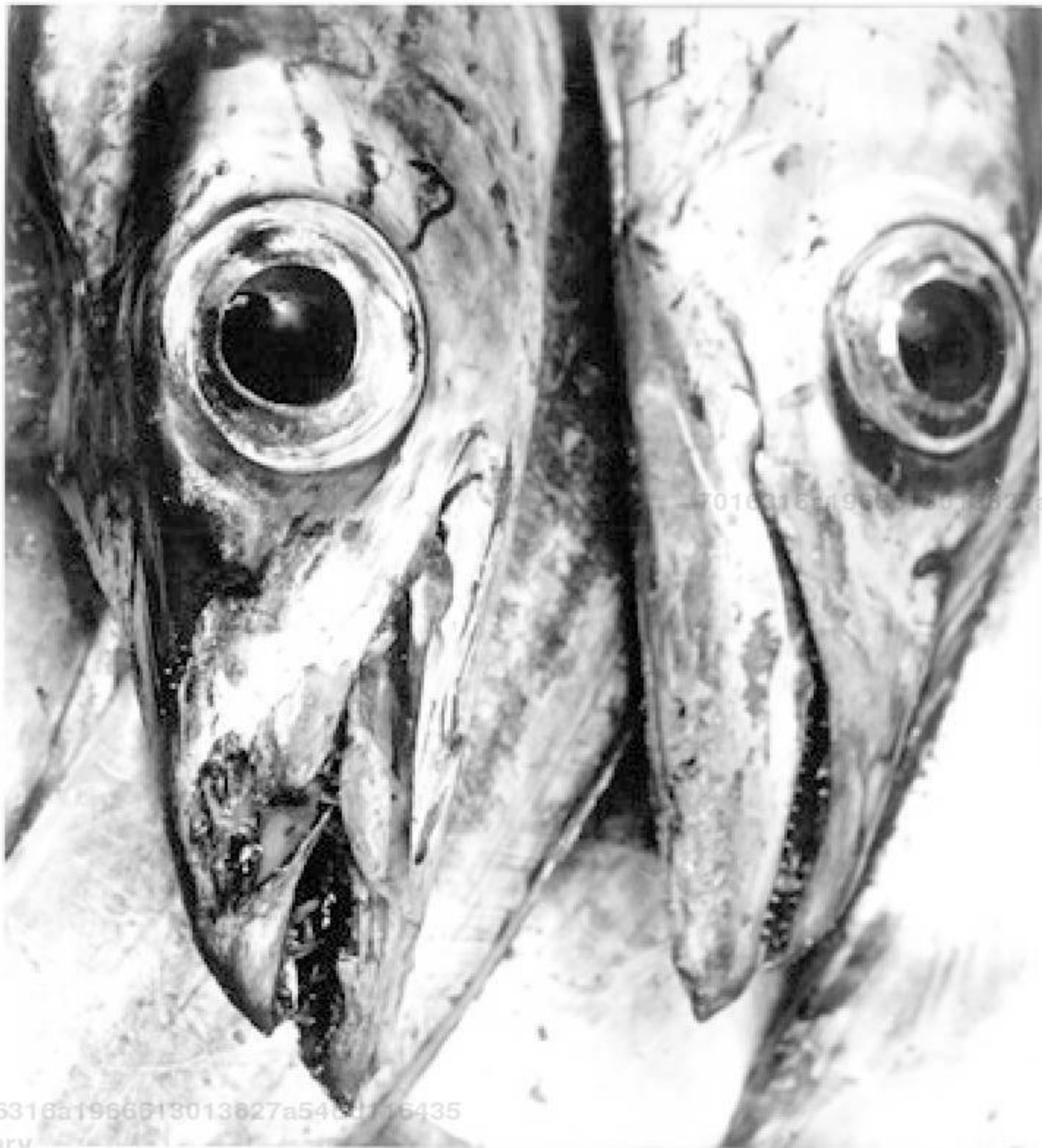
Figure 2.3 Leonore Mau and Hubert Fichte, Der Fischmarkt und die Fische (source still), 1968.

1968, which had been devastated by a disastrous earthquake in 1960. Their main focus in this photofilm is the reconstructed “modern” city on the one hand, and the continuing precarious living conditions and bleak opportunities of the inhabitants on the other. Commentary is by the narrator’s first person, who assumes the position of an inhabitant of Agadir (using material from interviews and conversations), and is spoken exactly over the images of the areas reconstructed in modernist architecture, providing an intended and stark contrast to the images of Agadir residents, over which texts from glossy brochures and propaganda of the public administration