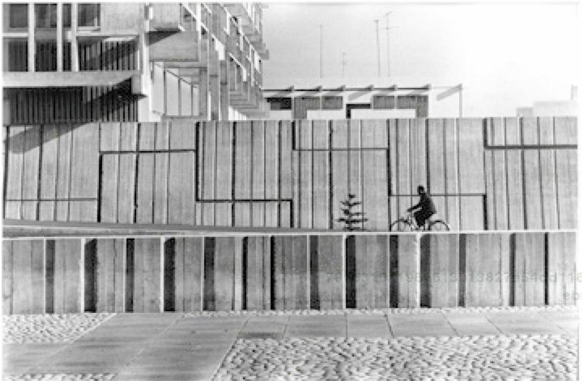
Figure 2.4 Leonore Mau and Hubert Fichte, Zwei mal 45 Bilder/Sätze aus Agadir (source still), 1971.

glorifying the reconstruction are spoken by a second narrator (Figure 2.4 and Figure 2.5). This simple, but effective device achieves a very contrastive black-and-white effect of image and text, and is, of course, familiar from 1920s and 1930s political montage, in both film and the graphic arts. 20 While the photofilms by Fichte and Mau retain a strong authorial voice, this is not to be confused with the off-screen, “voice of God.” The sequences of the images in their films are both set in rhythmic counterpoint to themselves and to the spoken text, propel the films forward, and continuously unsettle a unified authorial voice and photographer’s gaze.